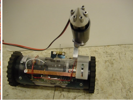
Figure 3. The Grappling Hook Scout carries a spring-loaded grappling hook that it can use to climb large obstacles.