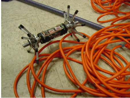
Figure 2. The Actuating Wheel Scout crawling over debris.

solenoid to selectively couple the center wheel shaft to the body of the Scout. The inner side of the wheel is directly attached to the drive gear as well as having a bearing over the center shaft. The other side of the wheel is on a thread that runs along the center shaft. Thus, the drive motor is used to power the linear actuator in the wheel whenever the solenoid is engaged.