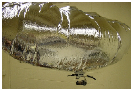
Figure 4. A Scout-controlled blimp. The fans that control the blimp’s motion are actuated instead of the Scout’s own wheels.

There are tradeoffs for using the blimp. The volume of the blimp is dependent upon the weight of the Scout and any other additional payloads that it may carry. The weight of a Scout and basic fans for control calls for a blimp with a volume of .4 m 3 of helium. This in turn requires that there is a minimum amount of clearance for the blimp Scout to pass through an area which determines whether it can make it through doors and around corners.