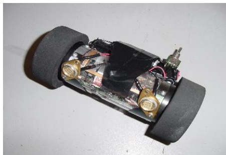
Figure 5. The IR Scout is equipped with infra-red emitting LEDs which allow the Scout’s camera to be used in complete darkness.